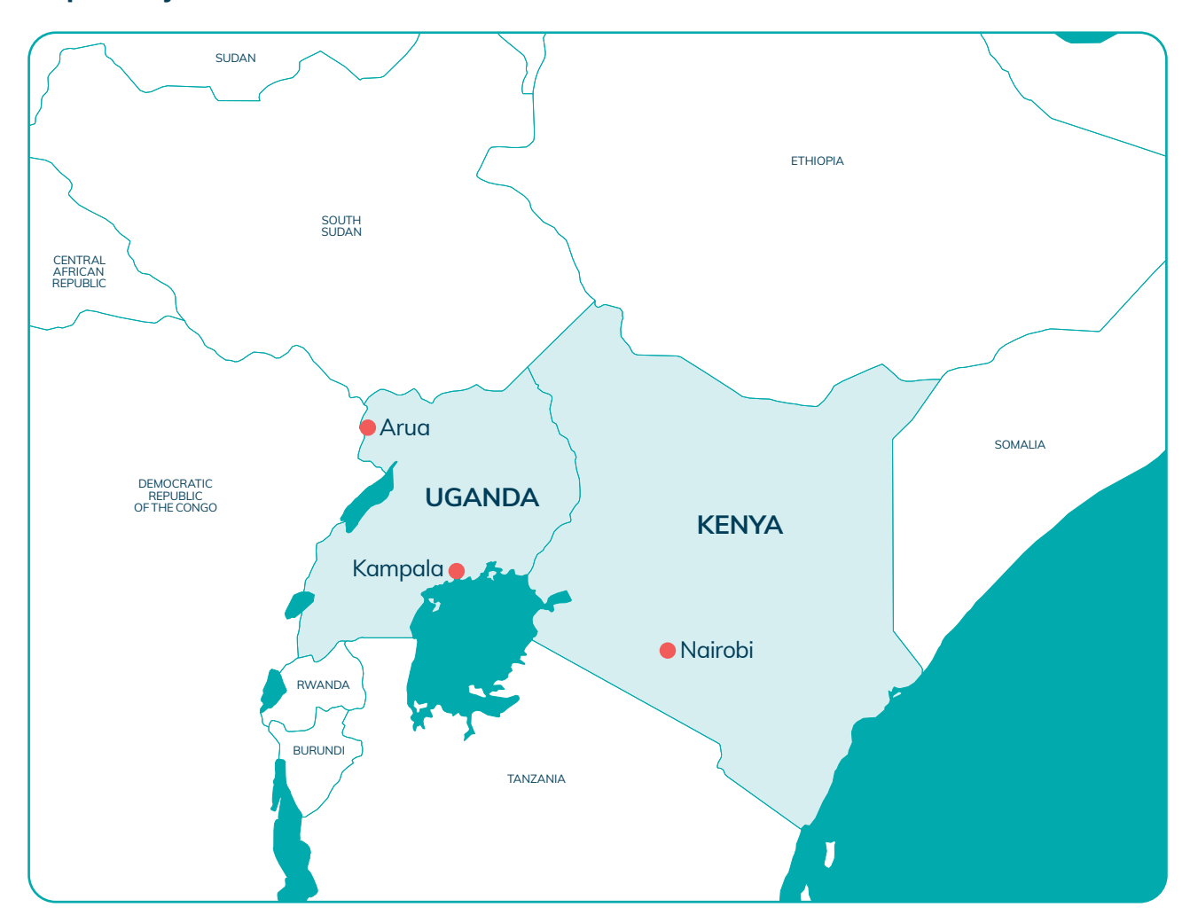
Map 1. Project locations