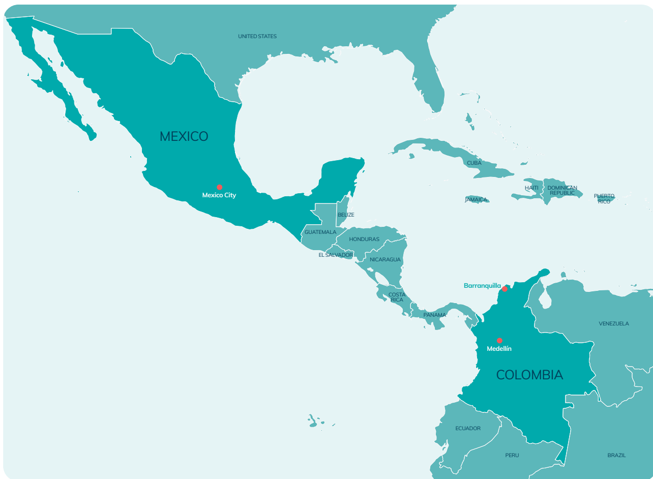
Figure 2. 4Mi Cities project locations

4Mi Cities aims to build evidence to better inform local responses to mixed migration in cities and create a strong case for national and international legal, fiscal and policy frameworks that enable cities to adequately provide necessary services to refugee and migrant populations. The data collected will be used by city governments involved in the project, as well as humanitarian and development actors, to improve their current migration policies and responses at city level.