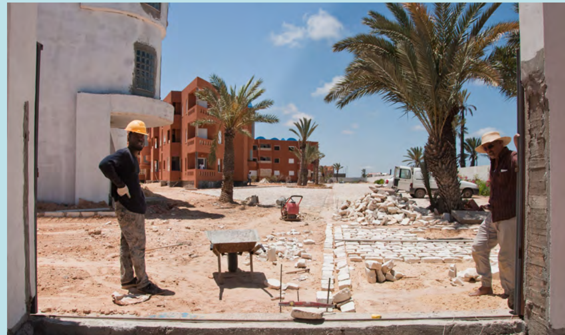
A migrant and his Tunisian employer are restoring a hotel in the South of Tunisia. Zarzis, Tunisia, June 2, 2020.

Refugees' and migrants' contributions to the Tunisian economy and its development often go unnoticed, since most engage in informal employment activities. Refugees and migrants are reported to fill gaps in several sectors by providing manpower and often working in physically demanding, largely low-skilled and informal jobs.