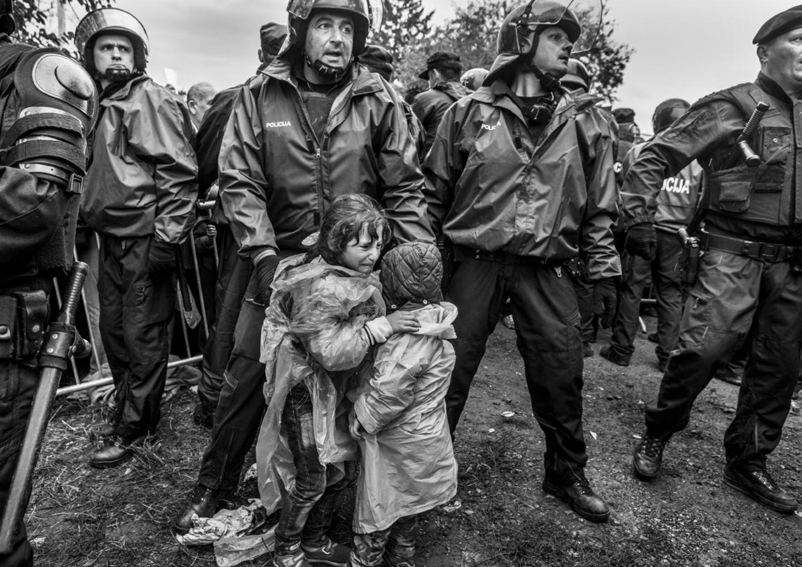
Tovarnik, Croatia (Date unspecified)

Two crying children standing beside a group of riot police in the middle of turmoil at the train station as thousands of refugees and migrants wait to get on a train or a bus. This image and the one below it show how the efforts to combat smugglers are entwined with efforts to control and prevent irregular movement of mixed migration. Unlike proactive efforts to stop drug trafficking, those related to stopping smugglers are primarily reactive and most commonly result in security forces interfacing with those on the move and not smugglers.