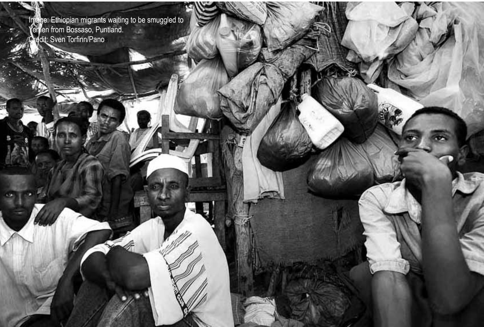
Image: Ethiopian migrants waiting to be smuggled to Yemen from Bossaso, Puntland.