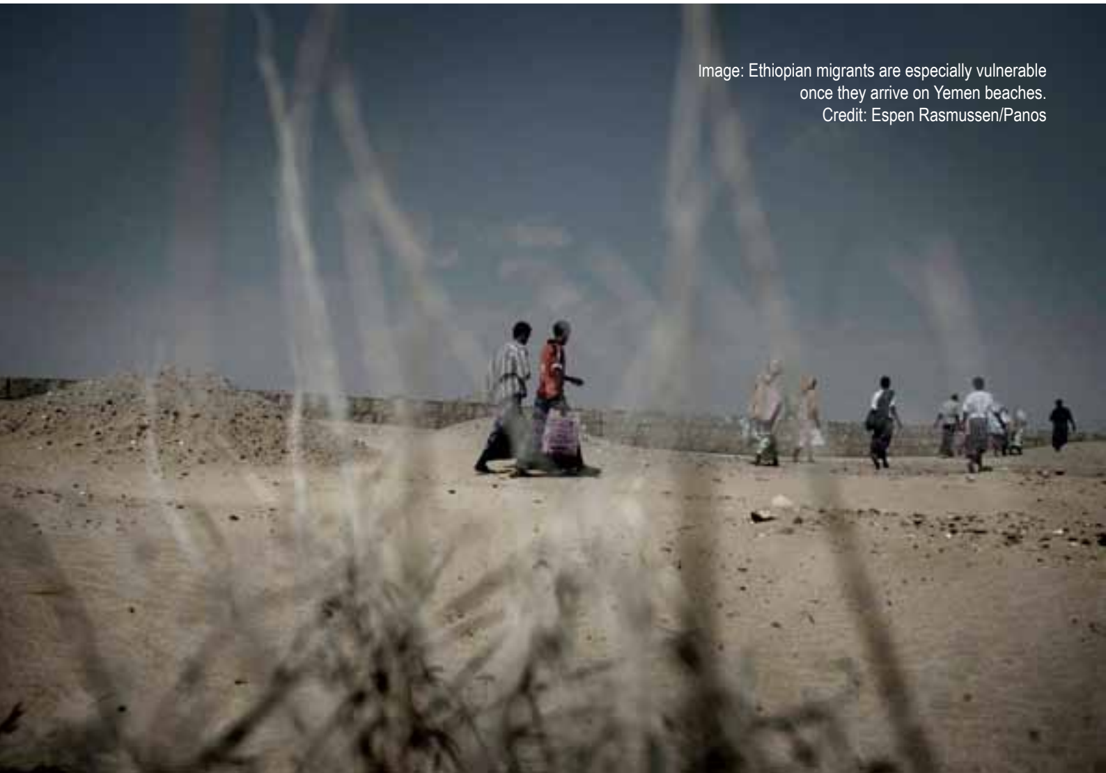
Image: Ethiopian migrants are especially vulnerable once they arrive on Yemen beaches.