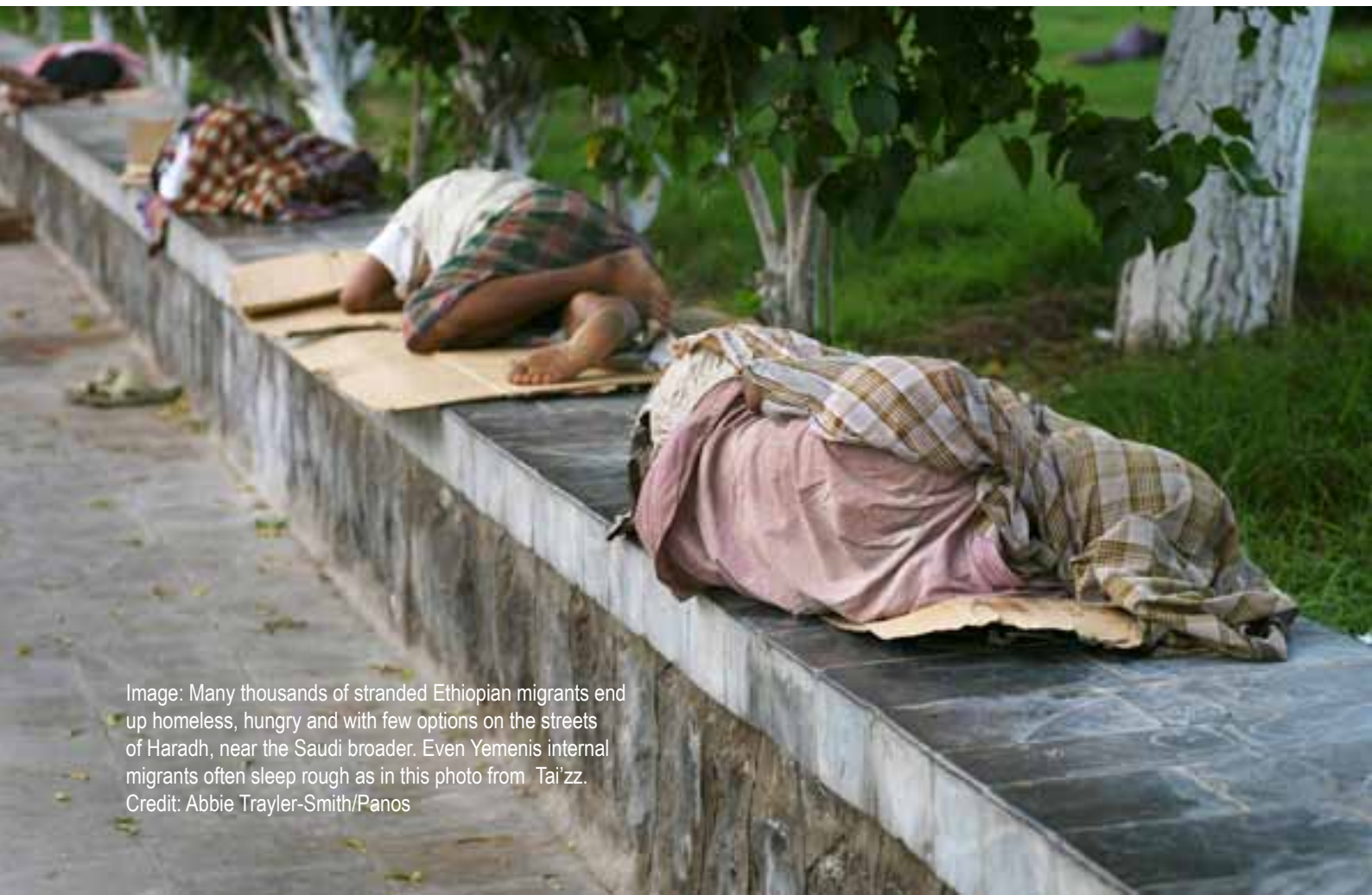
Image: Many thousands of stranded Ethiopian migrants end up homeless, hungry and with few options on the streets of Haradh, near the Saudi border. Even Yemenis internal migrants often sleep rough as in this photo from Tai'zz.

The lure and reality of economic opportunities in Saudi Arabia are sufficiently strong for Ethiopian migrants (and tens of thousands of Yemenis, Somalis and other nationalities) to repeatedly attempt to