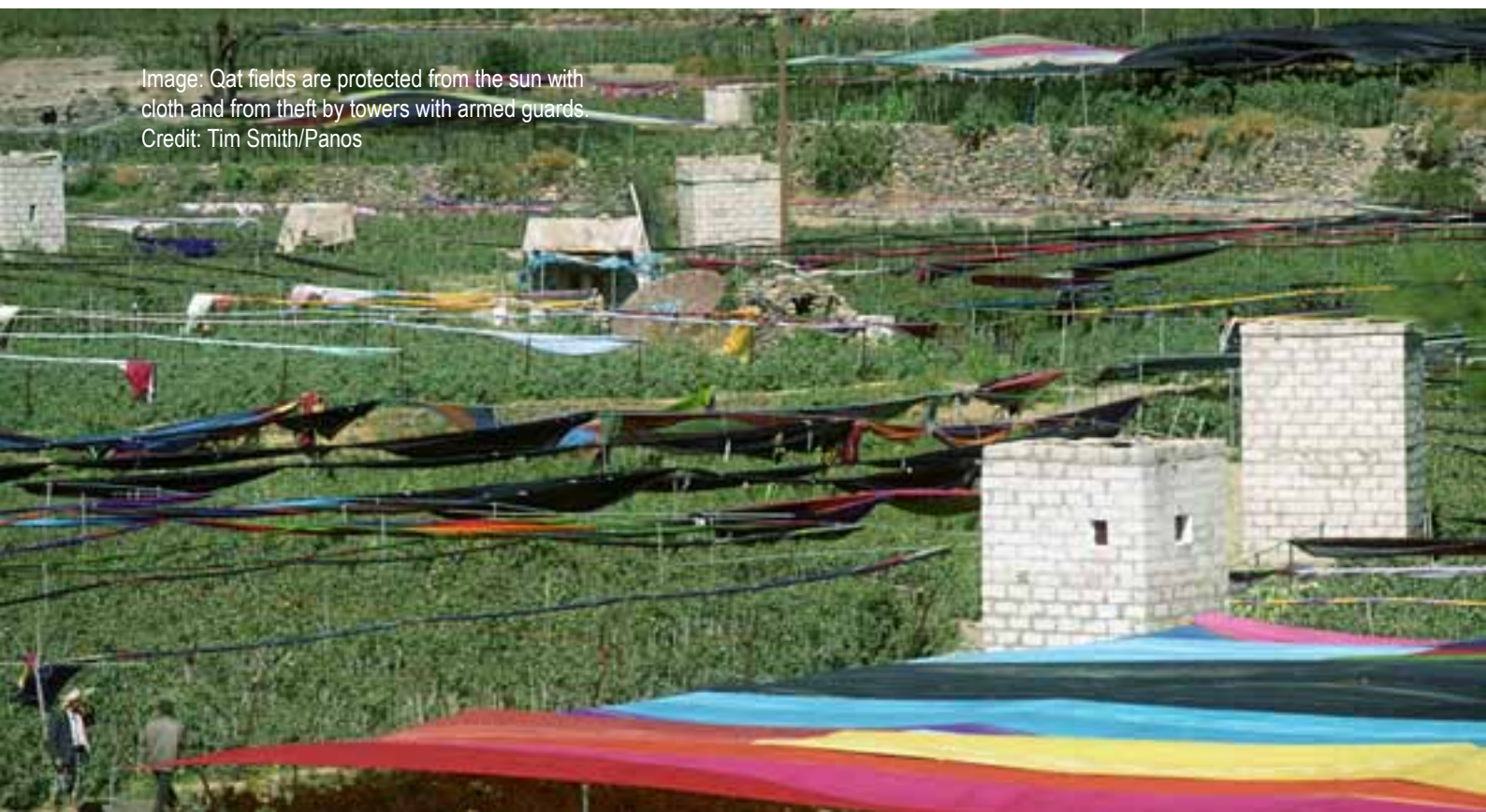
Image: Qat fields are protected from the sun with cloth and from theft by towers with armed guards.