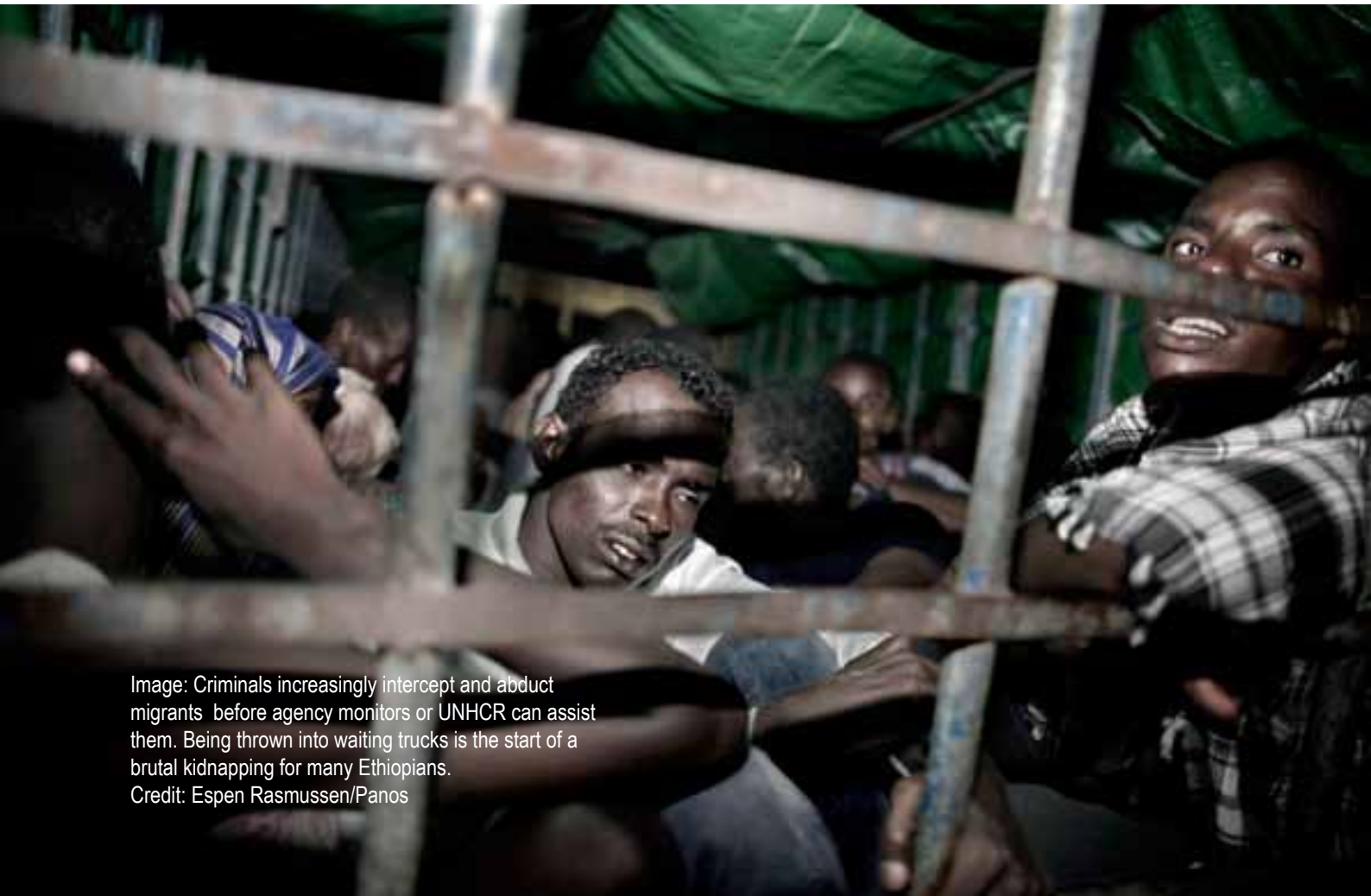
Image: Criminals increasingly intercept and abduct migrants before agency monitors or UNHCR can assist them. Being thrown into waiting trucks is the start of a brutal kidnapping for many Ethiopians.