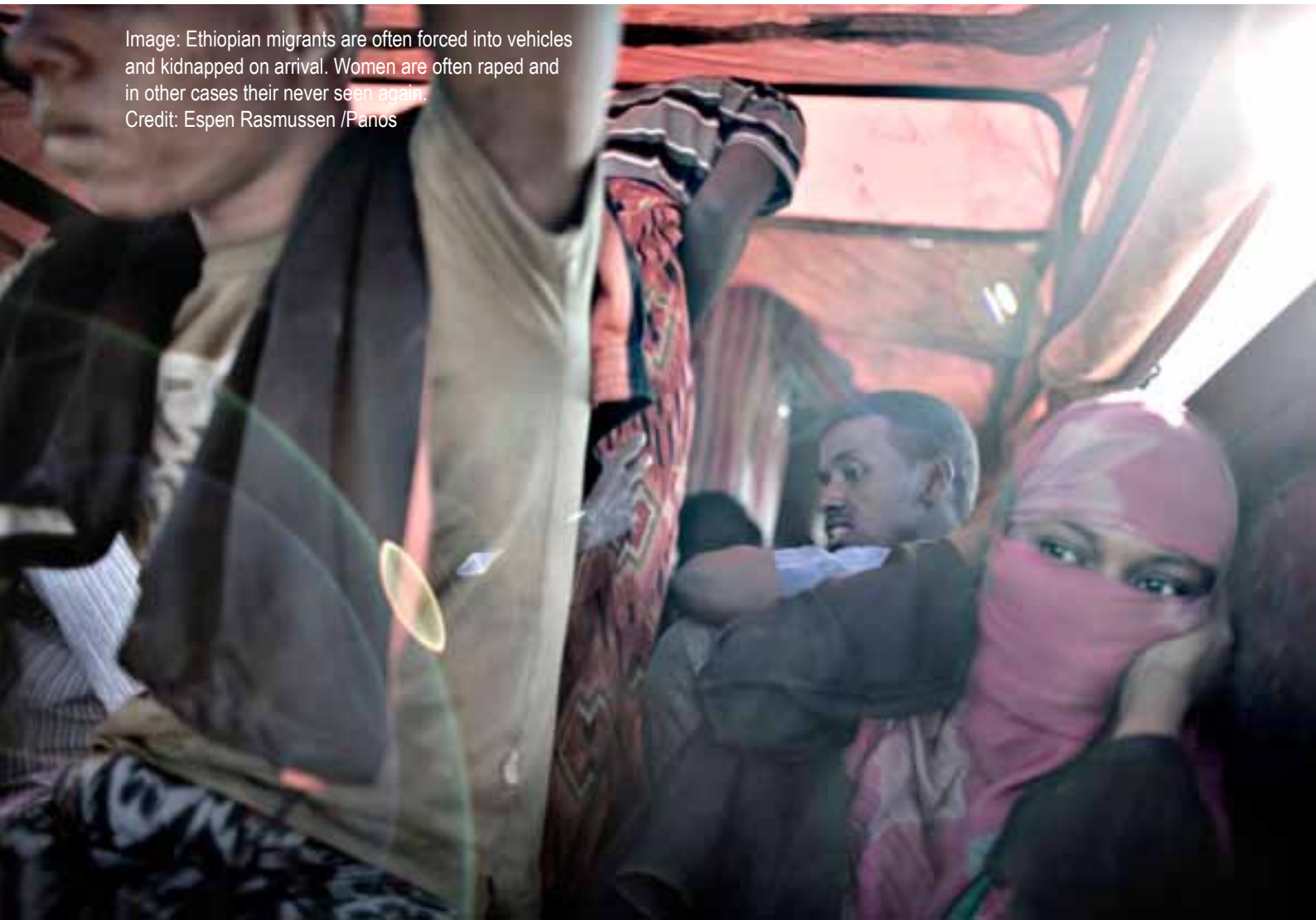
Image: Ethiopian migrants are often forced into vehicles and kidnapped on arrival. Women are often raped and in other cases their never seen again.

The international community has been aware of the hostage-taking and encouraged the government to take action - even during the tumultuous political changes of 2011/12. There was some condemnation of criminal activities involving migrants in the Yemeni press in 2011 and 2012 as the media took increased notice of their plight. In two events in early 2012, the authorities (both police and military) raided two compounds where 'African' (migrant) hostages were being held. The involvement of heavily armed military in the second raid suggested that they knew of the fire-power of the kidnappers, at the same time recognising that the local police force may have been compromised in terms of their possible collusion with