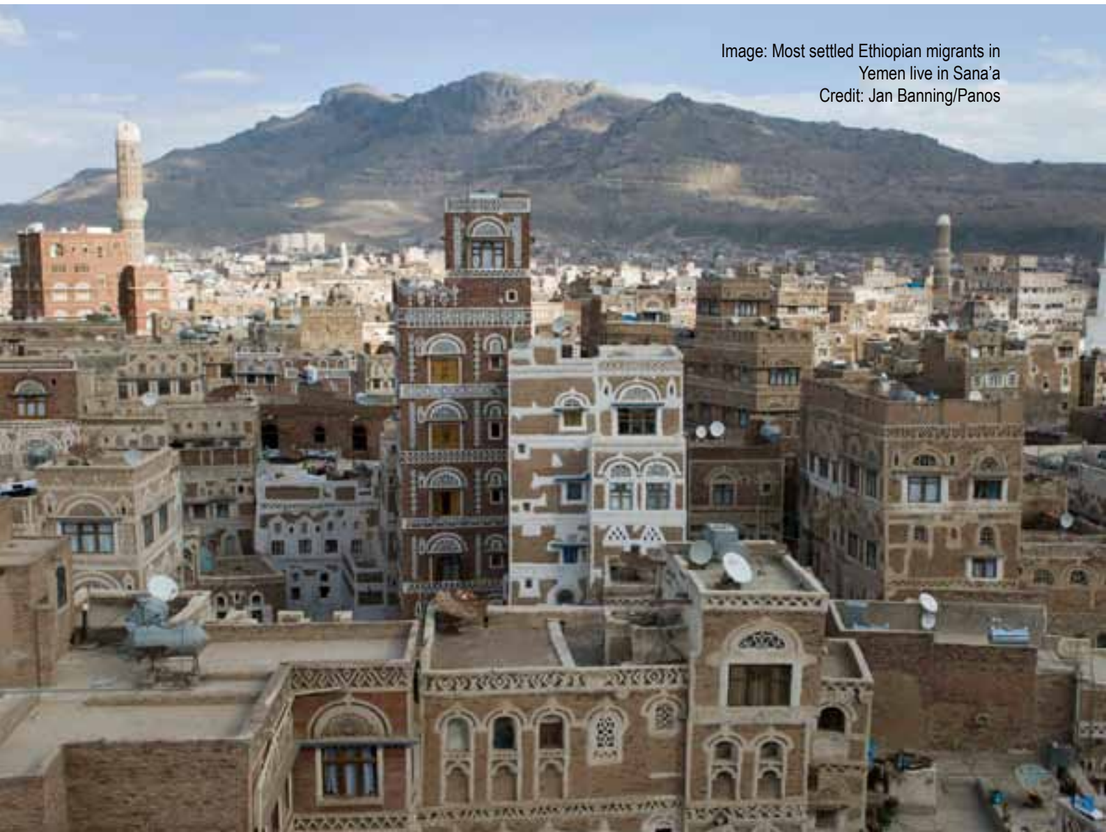
Image: Most settled Ethiopian migrants in Yemen live in Sana'a

There are options to return to Ethiopia regularly, but some respondents expressed a fear of returning