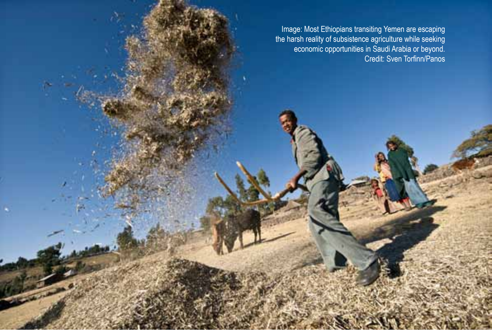
Image: Most Ethiopians transiting Yemen are escaping the harsh reality of subsistence agriculture while seeking economic opportunities in Saudi Arabia or beyond.

Other respondents from rural areas explained that the Ethiopian Government had taken their land for schemes backed by Government supporters. Although respondents acknowledged that there was financial compensation for those who had lost the right to farmland, without access to land the farmers are unable to generate an income and so are forced to leave. 41 Studies have confirmed that Ethiopia is vulnerable to climate change, which impacts on rural livelihoods 42 , but only one respondent cited this as a reason for migrating. A number of respondents blamed low rainfall and poor harvest as reasons for their migration, but did not indicate that they saw these as long-term shifts in climatic conditions. It is possible that the research was not conducted among respondents from the most affected areas, or that those questioned did not identify climate change as the root of their problems of low rainfall and poor harvests.