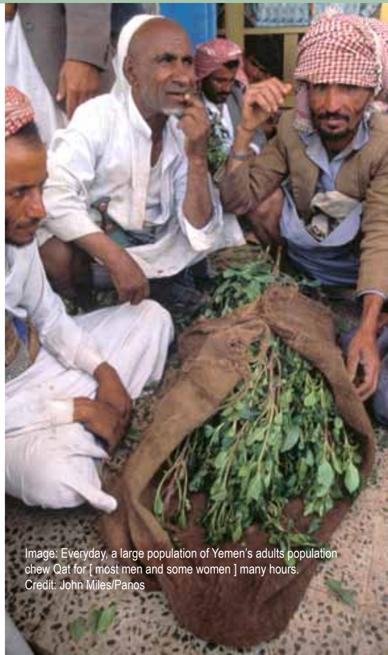
Image: Everyday, a large population of Yemen's adults population chew Qat for [ most men and some women ] many hours.