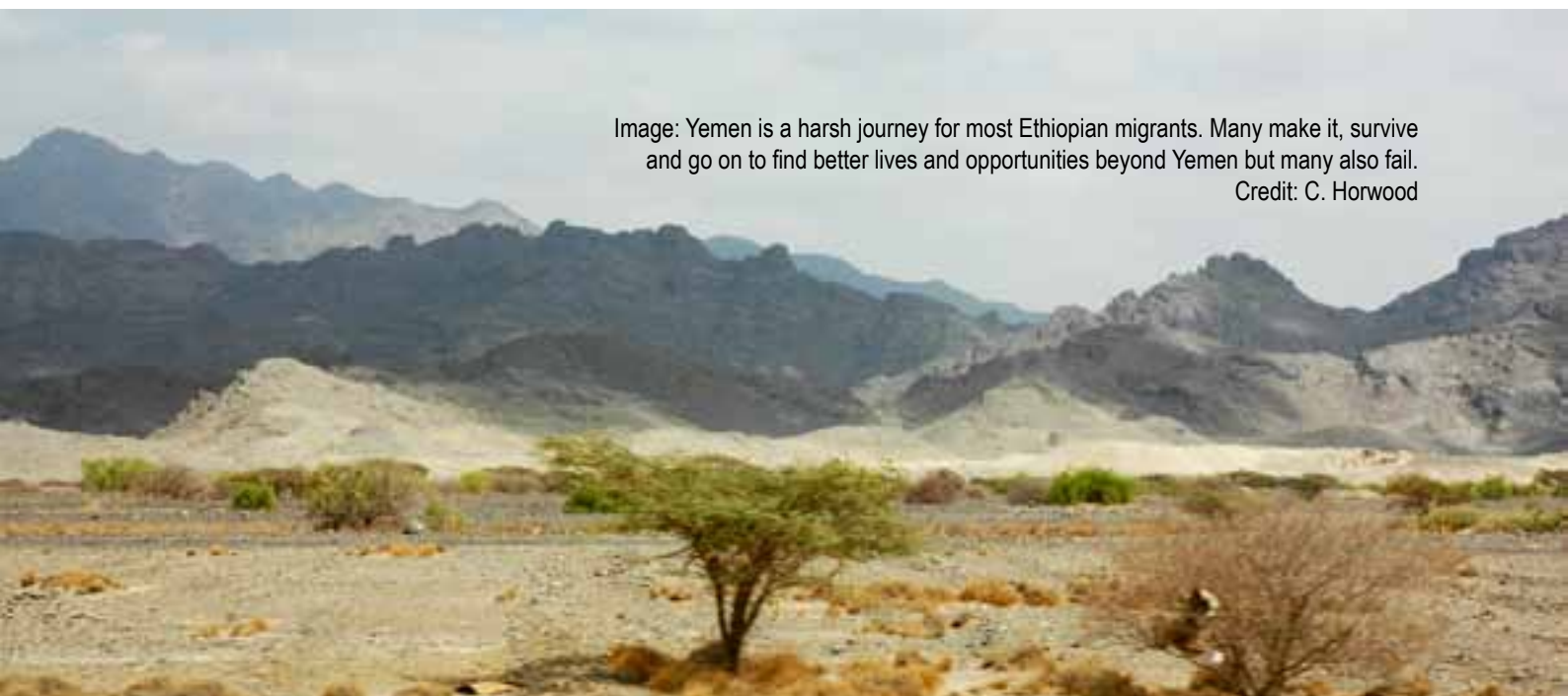
Image: Yemen is a harsh journey for most Ethiopian migrants. Many make it, survive and go on to find better lives and opportunities beyond Yemen but many also fail.