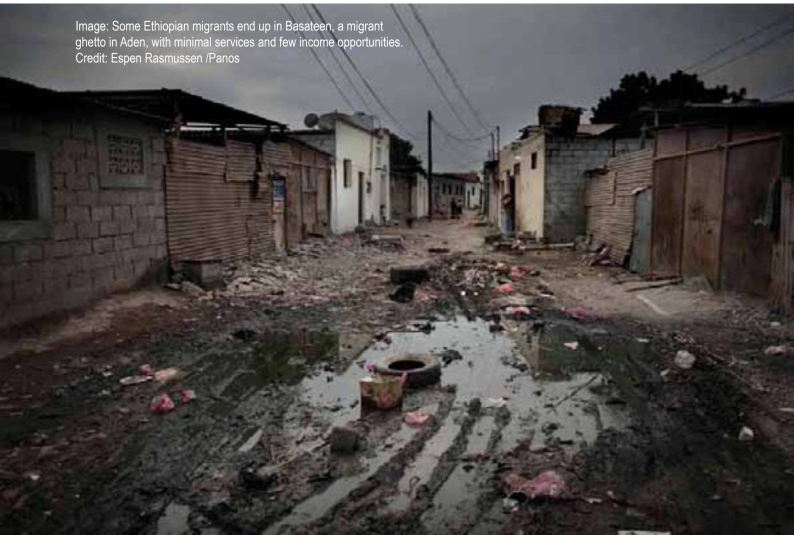
Image: Some Ethiopian migrants end up in Basateen, a migrant ghetto in Aden, with minimal services and few income opportunities.

The Saudi Arabian authorities are becoming increasingly harsh in their treatment of irregular migrants. Because conditions in Yemen and Ethiopia are leading to a larger number of Ethiopians and other migrants trying to enter Saudi Arabia, the country will continue to forcibly deport migrants through its desert border with Yemen. This will likely increase the presence of migrants in Yemen, in particular its border region.